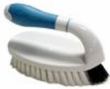
Standard Scrubbing brush