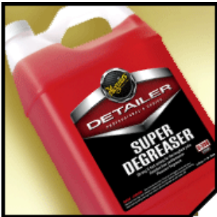
Meguiars Super Degreaser

When you take off the wheels, you will be presented with the usual mess of mud encrusted arches with fading trim. I will detail in a separate section, the method for effectively treating and painting your calipers. This section covers just the arches. The most effective tools are Meguiars Super Degreaser ( cut to a ratio of 4:1 ), a selection of scrubbing brushes, a bucket of soapy water and some elbow grease !!